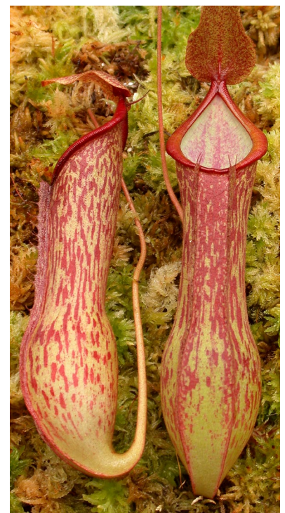
N. alata dark red spotted