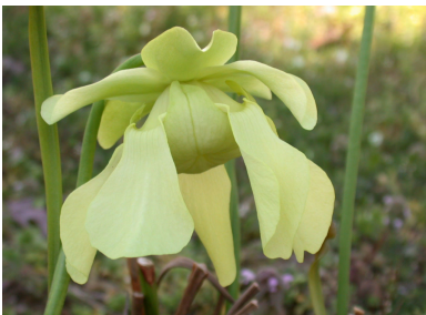
Below: S. alata flowers

#1 Dormant, bare-root. No foliage yet. Our lowest cost, large size Sarracenia. (Pot in 2–4 qt. pots.) Available only from Feb.–April. $10.00 each, plus shipping.