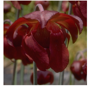
S. leucophylla , flowers above and pitchers below

Sarracenia are a attention-grabbing perennials with gorgeous flowers and fascinating, beautiful foliage. Our best-selling item for retailers is an assortment of species and hybrids (our choice), all identified, with care sheets available. Sarracenia are available in 3 grades; all are large ½ to 1 gal. pot size. Special color forms and named hybrids, see page 2, are not included in the pricing below.