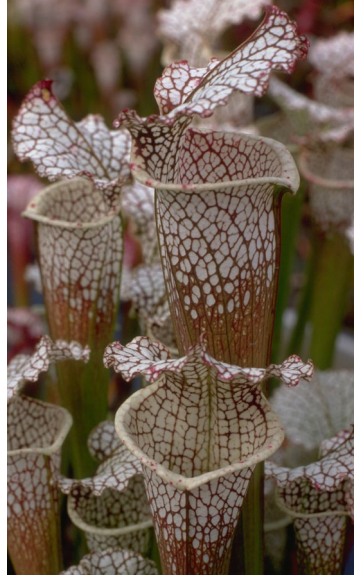
S. leucophylla Titan™

Other Genera, such as Nepenthes (shown below), Heliamphora and plants in very limited supply are listed when available.