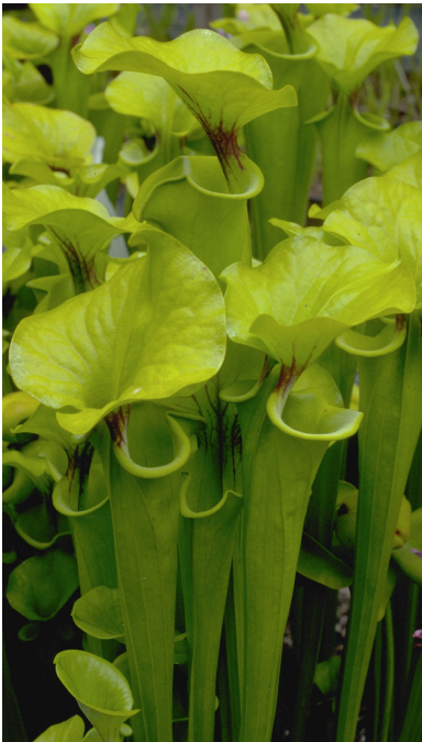
Above: S. flava pitchers (leaves)